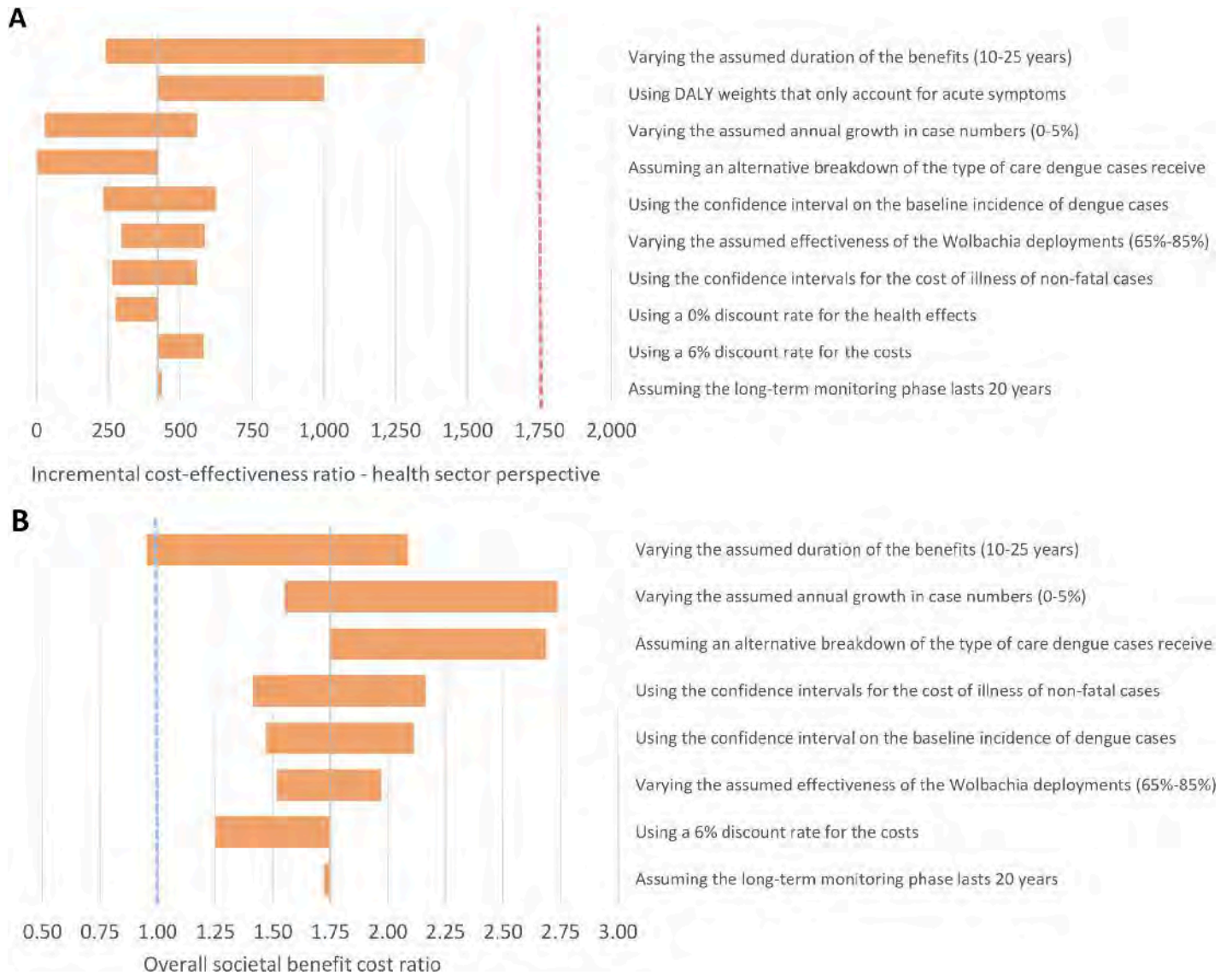
Fig 2. Tornado plot illustrating the impact of the sensitivity analysis on overall cost-effectiveness from the health sector perspective and overall societal benefit cost ratio Red dashed line indicates the cost-effectiveness threshold of 0.5 times Vietnam’s GDP per capita (i.e. <US$1,760 per DALY averted). The blue dashed line indicates a societal benefit cost ratio of one. The ranges investigated are provided in Table 2.

https://doi.org/10.1371/journal.pntd.0011356.g002